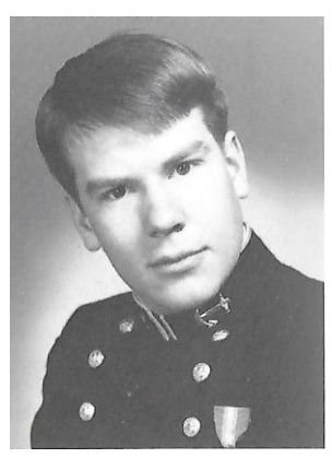
USNA '71 Yearbook